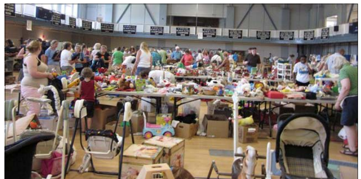
Tag Sale 2010 - Another huge Success