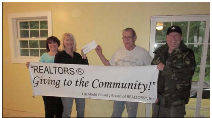
Representatives of Litchfield County Board of Realtors present $1000 check to Habitat